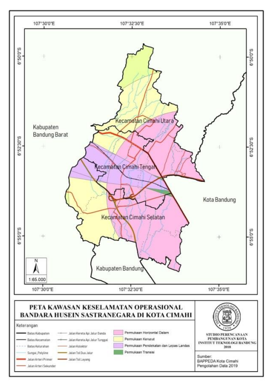
Figure 2. KKOP Map